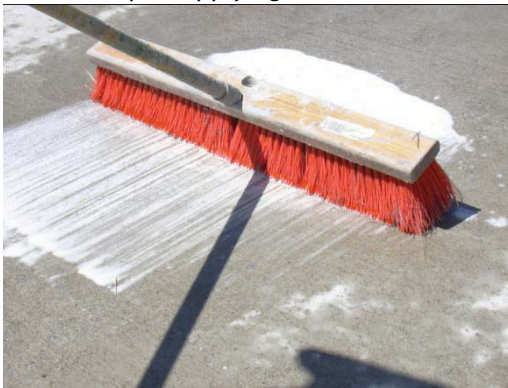
Example: Applying Etch N' Clean

of the concrete with a stiff bristle broom. The acid should only have contact with the concrete for a maximum of 10 minutes. Triple rinse thoroughly with water ( power washing is ideal ) and allow to dry a minimum of 8-10 hours . Remove loose aggregate by sweeping.