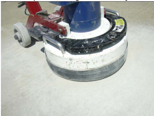
Example: Grinding concrete surface

of the concrete with a stiff bristle broom. The acid should only have contact with the concrete for a maximum of 10 minutes. Triple rinse thoroughly with water ( power washing is ideal ) and allow to dry a minimum of 8-10 hours . Remove loose aggregate by sweeping.