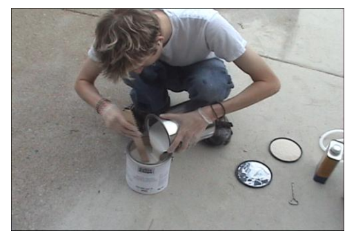
necessary. Do not add flow-control materials.