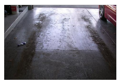
<u>Previously Painted Surfaces:</u> The waterborne components of this product generally allow use over most old coatings. Old coatings should be tested for lifting. If they lift, remove them.

Wash to remove contaminants. Rinse thoroughly with water and allow to dry. Dull glossy areas by light sanding. Remove sanding dust. Remove loose paint. If no lifting, lightly sand the surface and clean with TSP ( Trisodium phosphate ) or substitute.